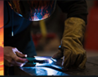
Welding Solutions & Development