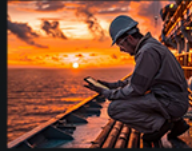
Ship Construction & Repair